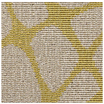
736 Visual Design