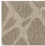
757 Form Relationship