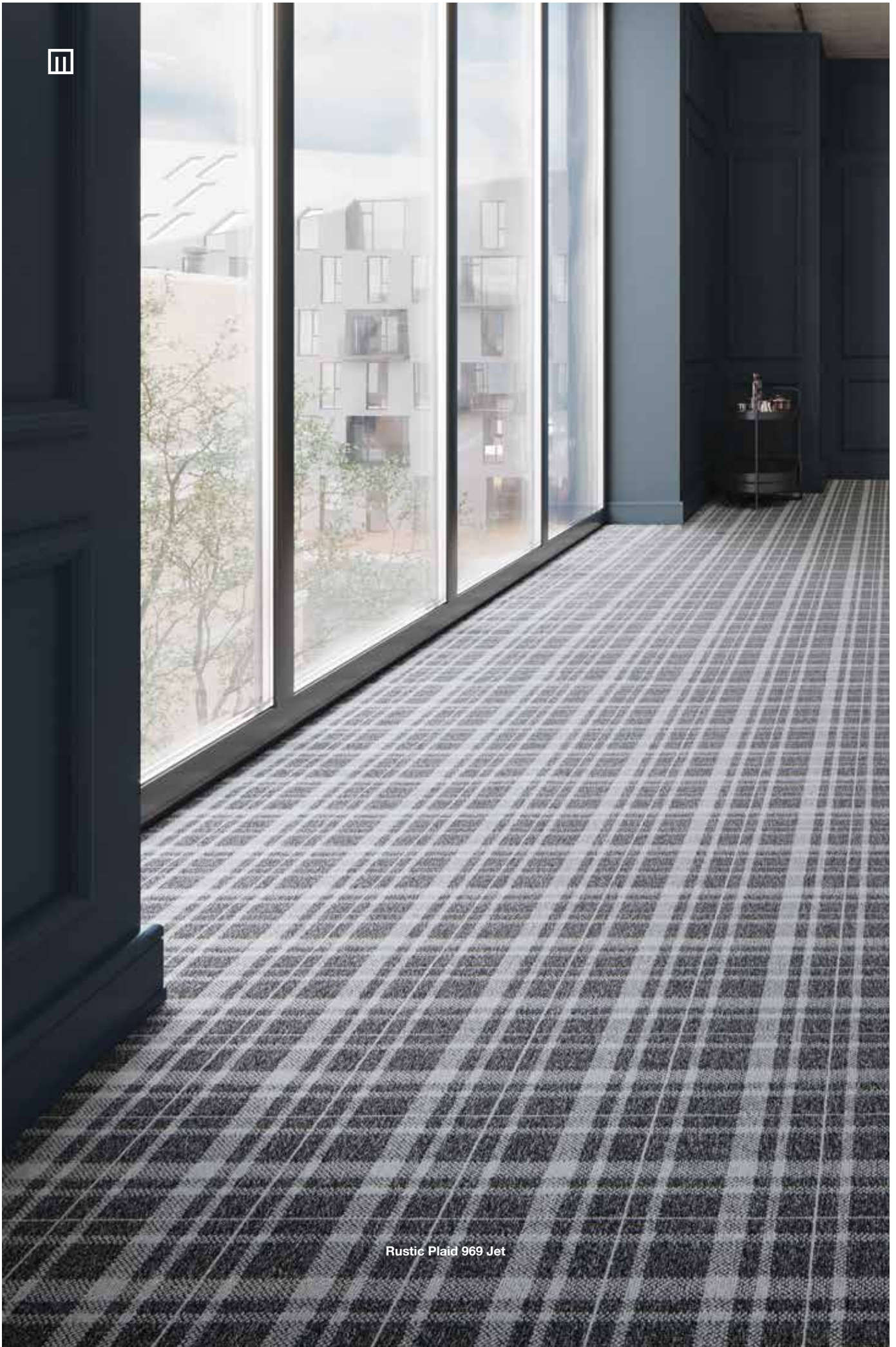
Rustic Plaid 969 Jet