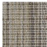
409 Gray Highway