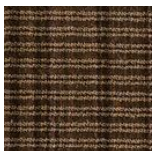
407 Loco Mocha