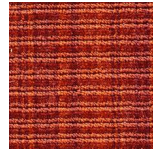
414 Slick Brick