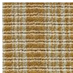
404 Keen Olive Green