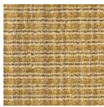
401 Max Flax