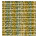
406 Spring Green Fling