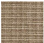
403 Graphite Pyrite