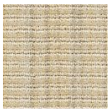
400 New Beige Rage