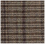
410 Great Slate