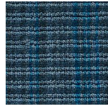
412 Cool Pool