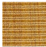
402 Cute Jute