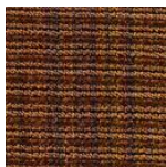
408 Down Town Brown