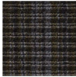
411 Cobalt Asphalt